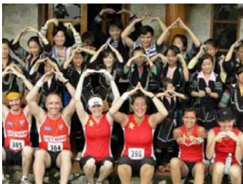
"Climb every mountain higher!"