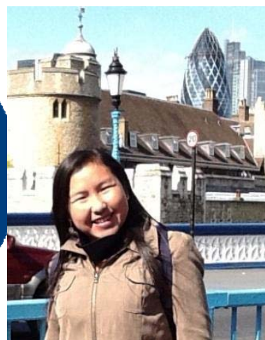
Shu in London