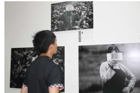
Time for reflection at the MTV EXIT exhibition