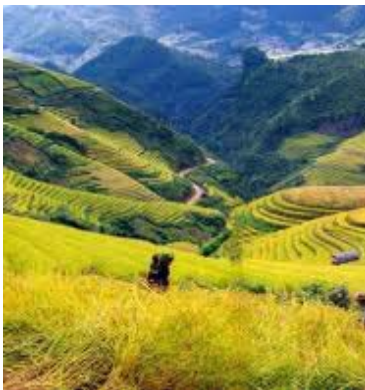
Let's keep it this beautiful!