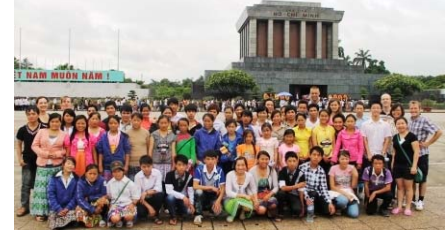
Sapa O'Chau at the Ho Chi Minh Mausoleum