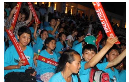
The kids rocking out!