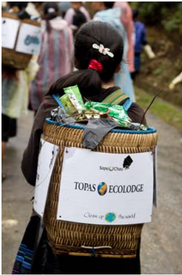
H'mong basket full of litter