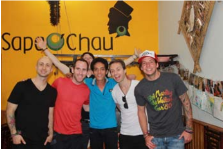
Simple Plan at the Sapa O'Chau Café.