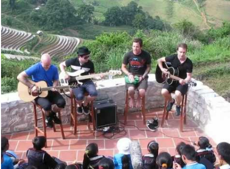
Students of Sapa O'Chau singing along with Simple Plan