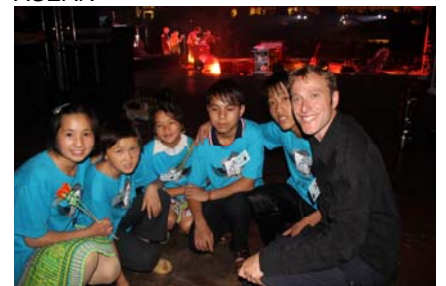
Backstage during Kate's set