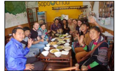
Family Meal at the Sapa O'Chau Café for volunteers and staff

The students' hunger for language acquisition is even greater than their hunger for a good meal. These appreciative children realize how