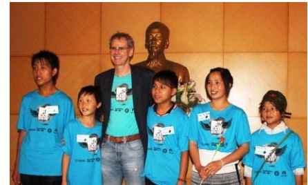
Students with the US ambassador to ASEAN