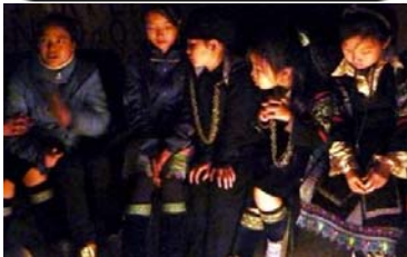
Ghosts, Candles & Popcorn for an unforgettable Earth Hour 2012