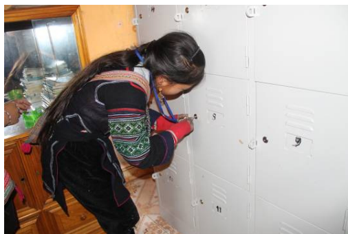
The children get lockers in the classroom!