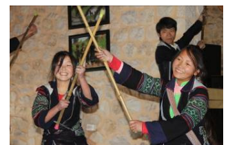
Topas Ecolodge Christmas Show