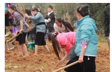
Dig for Victory!