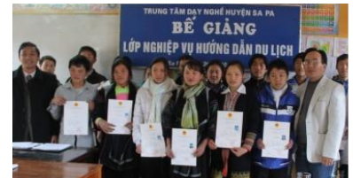
Students awarded their local tour guide licenses