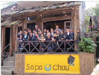
The new Sapa O'Chau Café