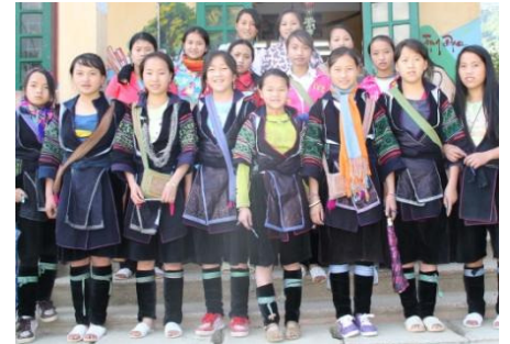
Students gain their Viet School Certificates