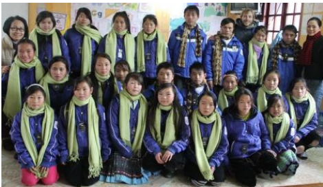
New winter clothes from PetroVietnam