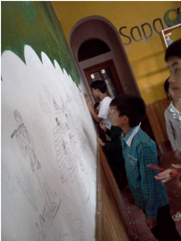
Children's Artwork at the Cafe