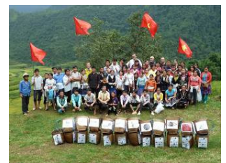
Clean Up the World Weekend 2011